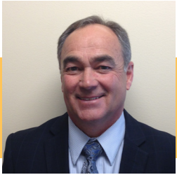
Craig Buttars Cache County Executive